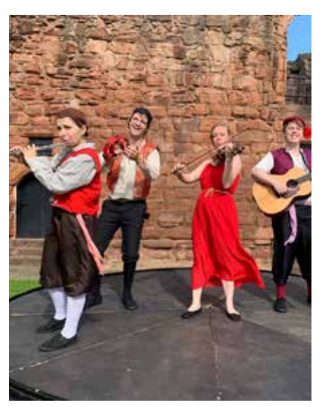
THEATRE AS YOU LIKE IT TUESDAY 27 AUGUST

£14.00 advance / £18.00 on the door Bar opens at 7:00 P.M. Starts at 8:00 P.M.