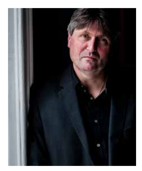
POETRY SIMON ARMITAGE – POET LAUREATE TUESDAY 24 SEPTEMBER

£28.50 advance Bar opens at 6:30 P.M. Starts at 7:30 P.M.