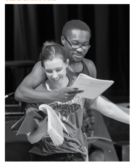
COMMUNITY EVENT / THEATRE

£14.00 advance / £18.00 on the door Bar opens at 7:00 P.M. Starts at 8:00 P.M.