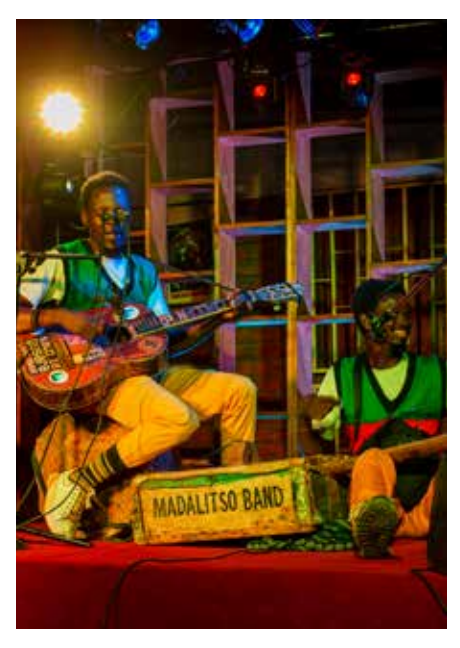
From £8 2 performances at 2:00 P.M. and 6:00 P.M.

This is the Summer Showcase from the Marine Youth Theatre (MYT) featuring scenes, songs, monologues, duologues, poems, and musical numbers. This showcase gives all of the MYT members an opportunity to perform on the big stage.